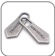
47823 mm 12,5x33