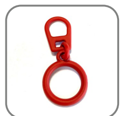
N3534 mm 14x31