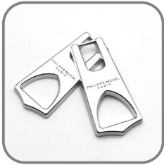
49411 mm 14,5x32