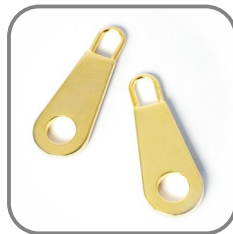
32138 mm 13x36,5