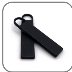
30734 mm 9x41