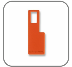
N3629 mm 15x40