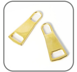
32181 mm 14,5x35