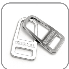
N3509 mm 11x20