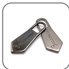
48181 mm 12,5x33