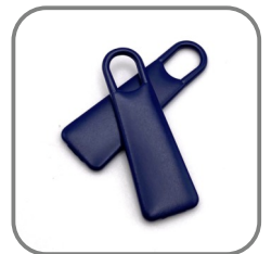
N3523 mm 11,5x37