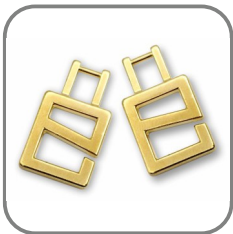
N4159 mm 16x27