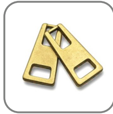
32218 mm 10x20