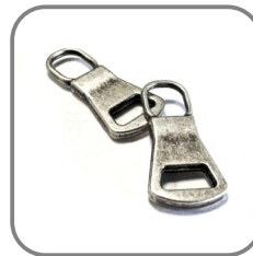
31663 mm 13x28