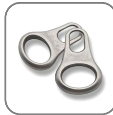
32199 mm 17x27