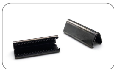
28062 mm 20x8