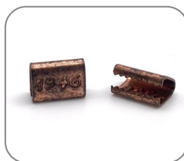
47604 mm 10x8