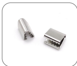
31197 mm 7,5x8