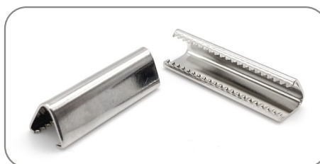
30338 mm 25x8