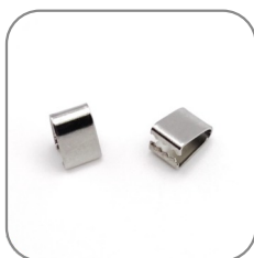
31196 mm 5x8