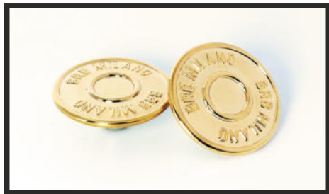
N4120 mm 23