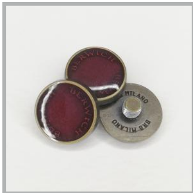
48449 mm 17