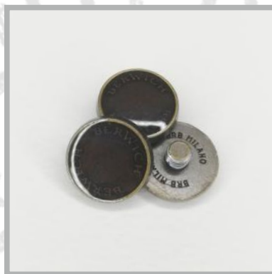
48447 mm 17