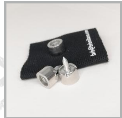
29574 mm 8

POSSIBILITA' DI CAMBIARE POSSIBILITY OF CHANGE