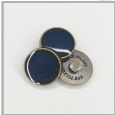
48448 mm 17