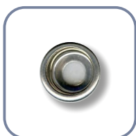
B DOLCE 23320