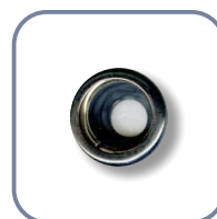
B DOLCE 23323