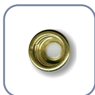
B DOLCE 24987